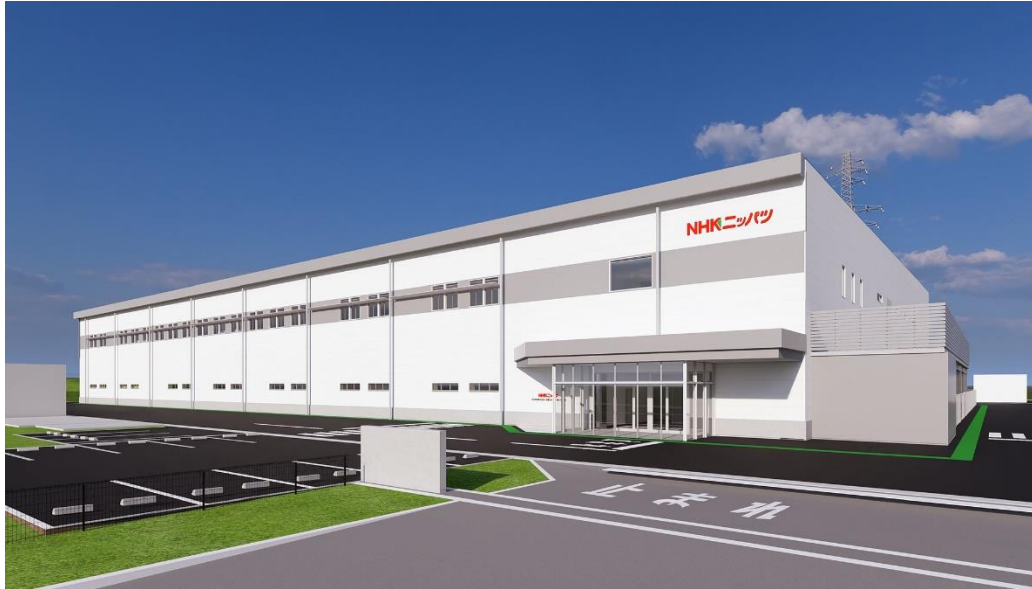
The exterior of the new production building of the Industrial Machinery and Equipment Division's Komagane Plant (for reference)